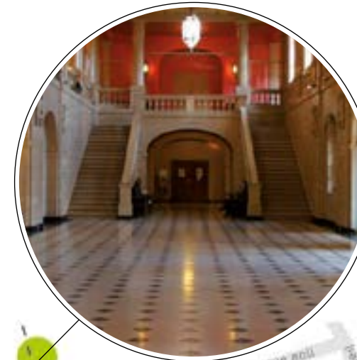
Access to the Konrad Adenauer Room (1st floor) from the entrance hall.