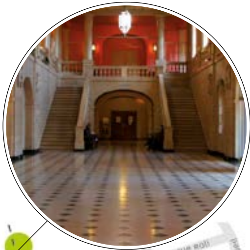
Access to the Konrad Adenauer Room (1st floor) from the entrance hall.